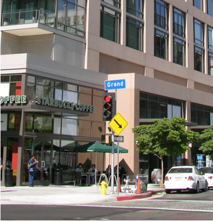
Corner curb extension at Grand Avenue and 11th Street.