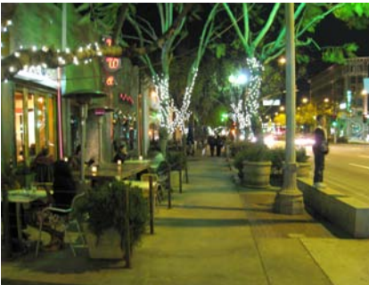
Streetscape improvements should support activity during both day time and evenings.