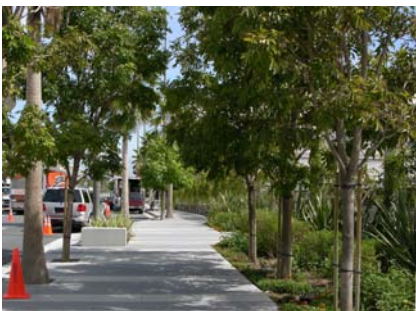
Streetscape improvements will vary by district and project.