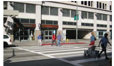
Mid-block crosswalks on north-south streets improve pedestrian access.