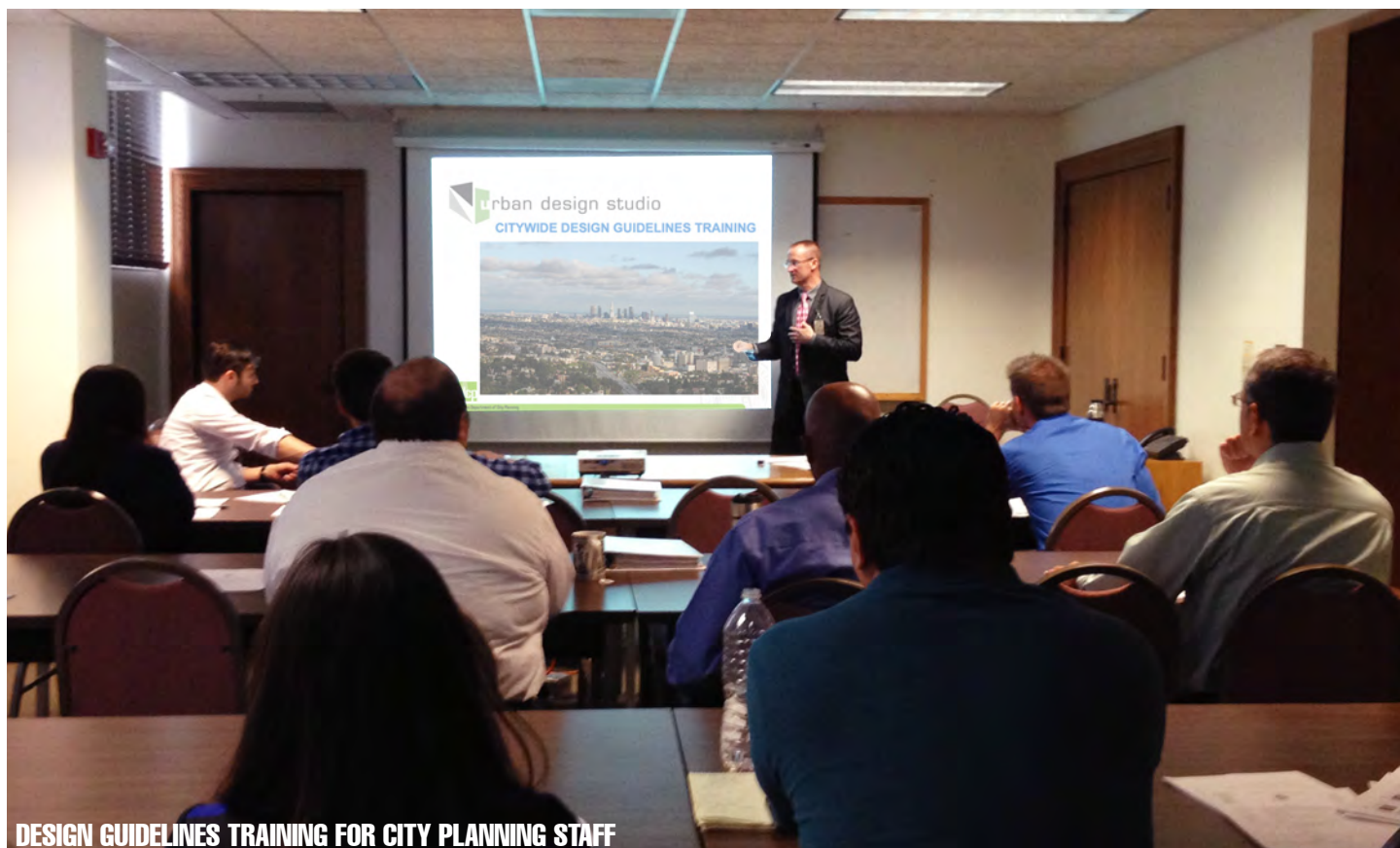
DESIGN GUIDELINES TRAINING FOR CITY PLANNING STAFF

Do Real Planning (2007) As Originally Issued by Los Angeles City Planning Commission