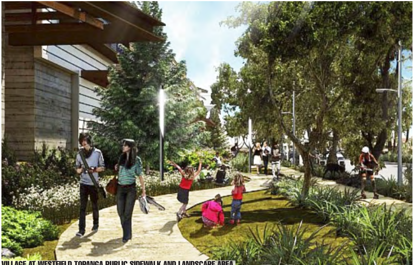
GE AT WESTFIELD TOPANGA PUBLIC SIDEWALK AND LANDSC/

Do Real Planning (2007) As Originally Issued by Los Angeles City Planning Commission