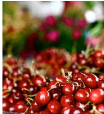
Farmers markets provide farm-to-table fresh food opportunities (Olympia, WA)