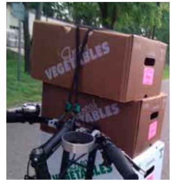
Non-traditional produce delivery increases access to healthy food (Boston, MA)