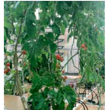
Technology assisted farms can provide high-yield produce where land is scarce {New York, NY}