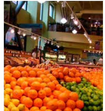
Retail markets provide a wide variety of healthy produce options (Portland, OR)