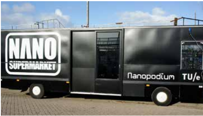
Mobile markets bring nutritious food to access-inhibited communities (Amsterdam, Netherlands)