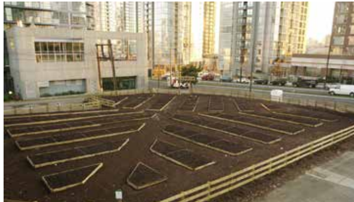
Utilize available land in urban areas for community gardens and urban agriculture {Vancouver, Canada}