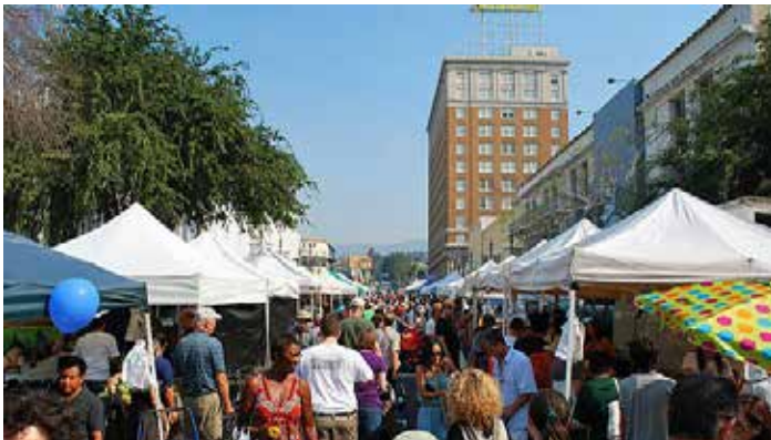
Farmers' markets encourage direct interaction between farmers and consumers enabling access to fresh food (Hollywood, CA)