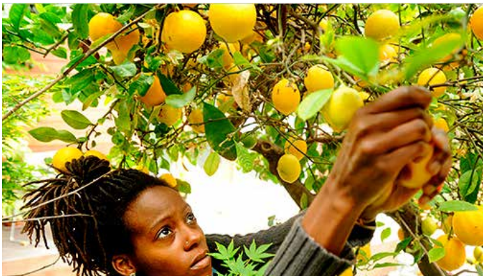
Publicly accessible fruit trees are abundant in Los Angeles and provide a source of nutritious food {Los Angeles, CA}