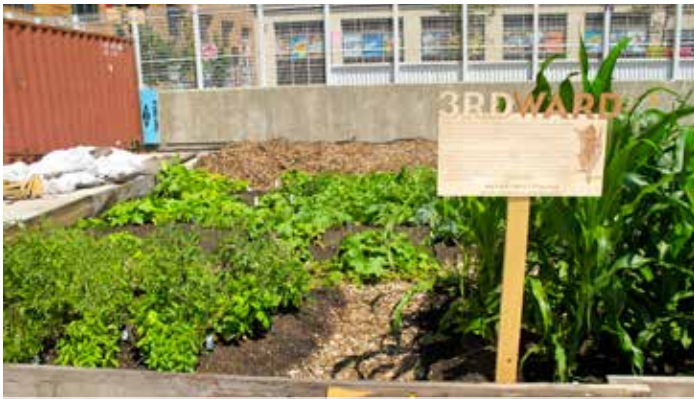
Signage in community gardens provide educational and community art opportunities {Brooklyn, NY}