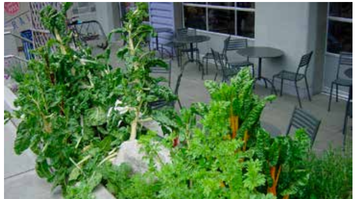
Nontraditional elements, such as street parkways, can be used as food-growing opportunities {Seattle, Washington}