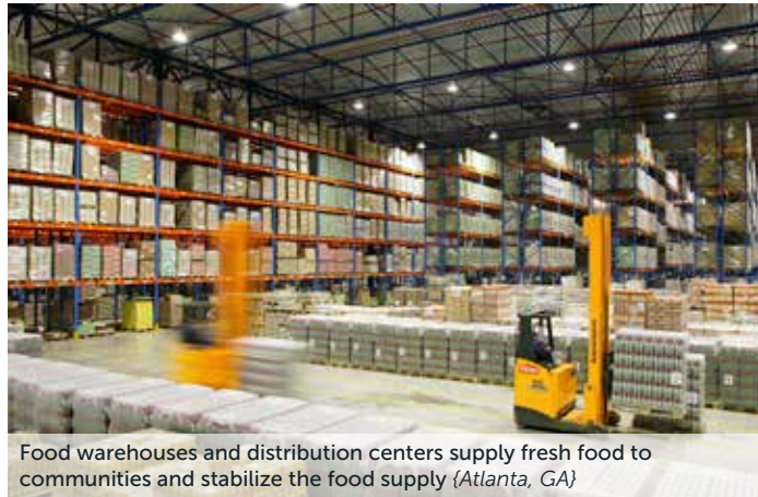
Food warehouses and distribution centers supply fresh food to communities and stabilize the food supply (Atlanta, GA)