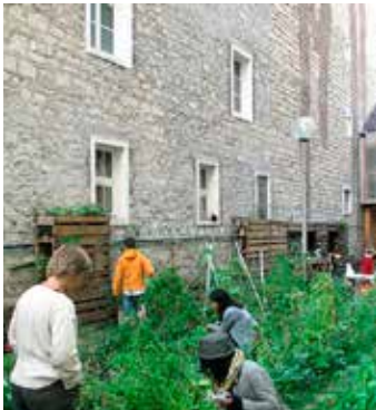
Disused alleyways and courtyards can provide food growing opportunities {Paris, France}