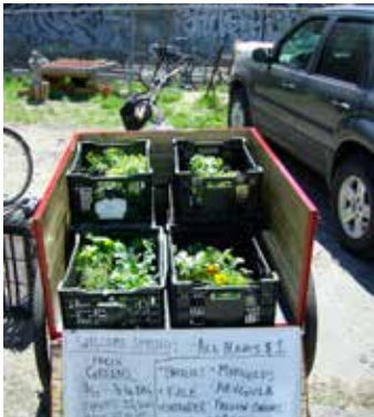
Community-based delivery methods can be utilized in food-deserts (Boston, MA)