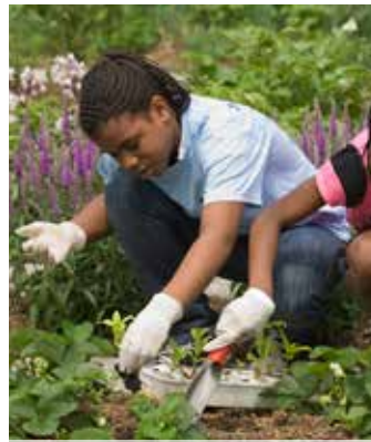
Community farming builds relationships {Chicago, IL}