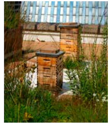
Beekeeping is popular in urban garden settings {Chicago, IL}