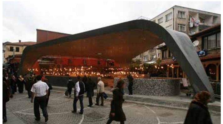
Community based markets can provide culturally specific food and produce (Istanbul, Turkey)